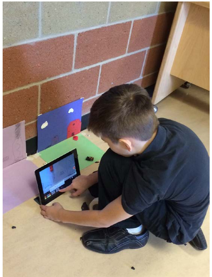
Stop Motion Animation