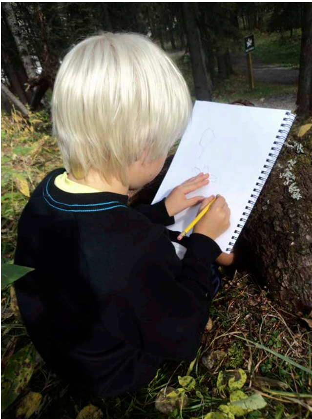
Science Observation & Sketching